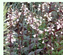
Penstemon digitalis 'Husker Red'