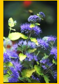
Caryopteris 'Sunshine Blue'

Caryopteris provides late season bloom when many other plants have passed their prime. 'Sunshine Blue' with its bright yellow foliage and rich amethyst blue flowers looks great in mixed borders or in mass plantings in sunny dry locations.