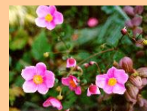
Anemone hupehensis (ah-NEM-oh-nee)