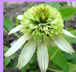
Echinacea 'Coconut Lime'