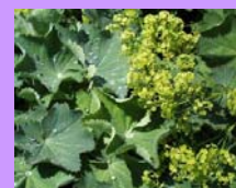
Alchemilla mollis (al-keh-MILL-uh)