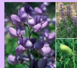
Baptisia australis (bap-TEEZ-ee-uh) aka: Blue False Indigo

Baptisias produce colorful 1' spikes of pea-like indigo-blue flowers over blue-green foliage in late spring. Dried seed pods add interest to the late-summer and fall garden, and are also attractive in arrangements. They are tough, long-lived, low-maintenance perennials for the back of the border. Baptisias grow slowly at first but eventually spread to form huge clumps with deep taproots that are difficult to transplant.