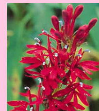
Lobelia x 'Ruby Slippers' (low-BEE-lee-uh)

Erect spikes of velvety ruby red flowers.