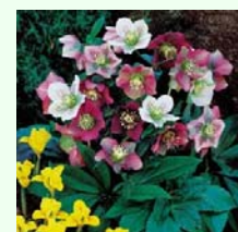
Helleborus x hybridus (Hel-LEB-or-us ex HY-brid-us) aka: Lenten rose